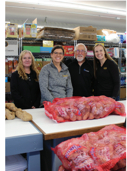
Barron Electric Cooperative employees teamed up with Nuto Farms and delivered over 3,000 pounds of potatoes to 13 food pantries.

Barron Electric Cooperative donated money to several local organizations, helping improve the quality of life in the rural area. *Scholarships and donations from Barron Electric are funded through the Federated Youth Foundation, an administrative trust managing unclaimed cashback credits of former members. The foundation has specific guidelines on how these funds can be utilized. Legally, Barron Electric cannot use unclaimed cashback credits to lower rates.