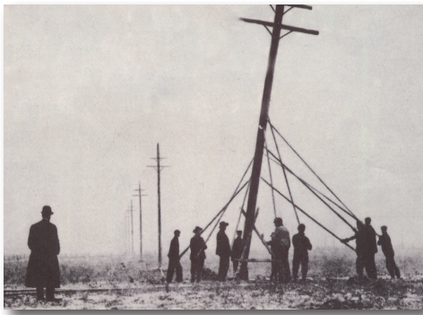
The first line was energized on November 22, 1937 with 125 connected members.