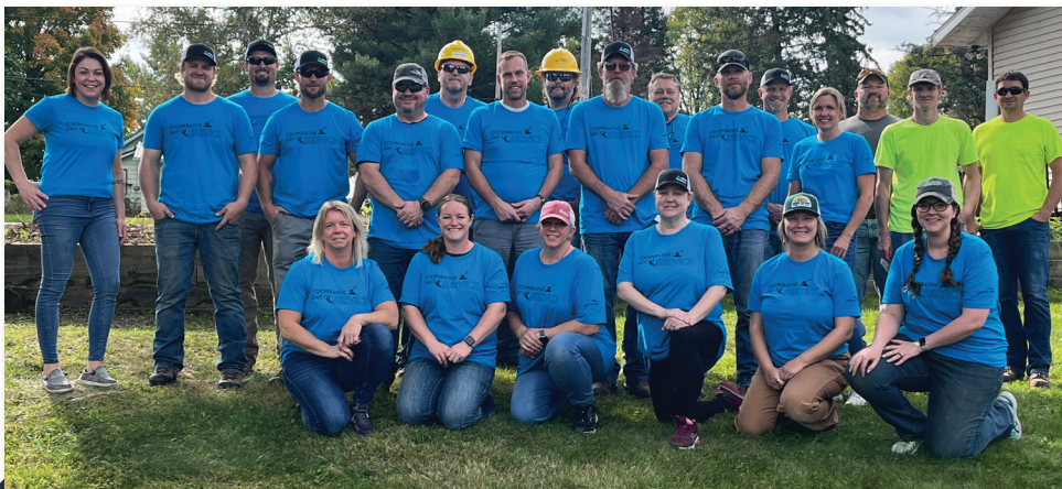
Barron Electric and Dairyland Power spent a day at Birchwood Senior Citizen's Center making improvements at their facility.

Barron Electric's Scholarship Program* has awarded nearly 500 scholarships totaling more than $440,000. Our scholarship program offers a variety of opportunities to member students, and we are excited to recognize this year's winners at today's meeting.