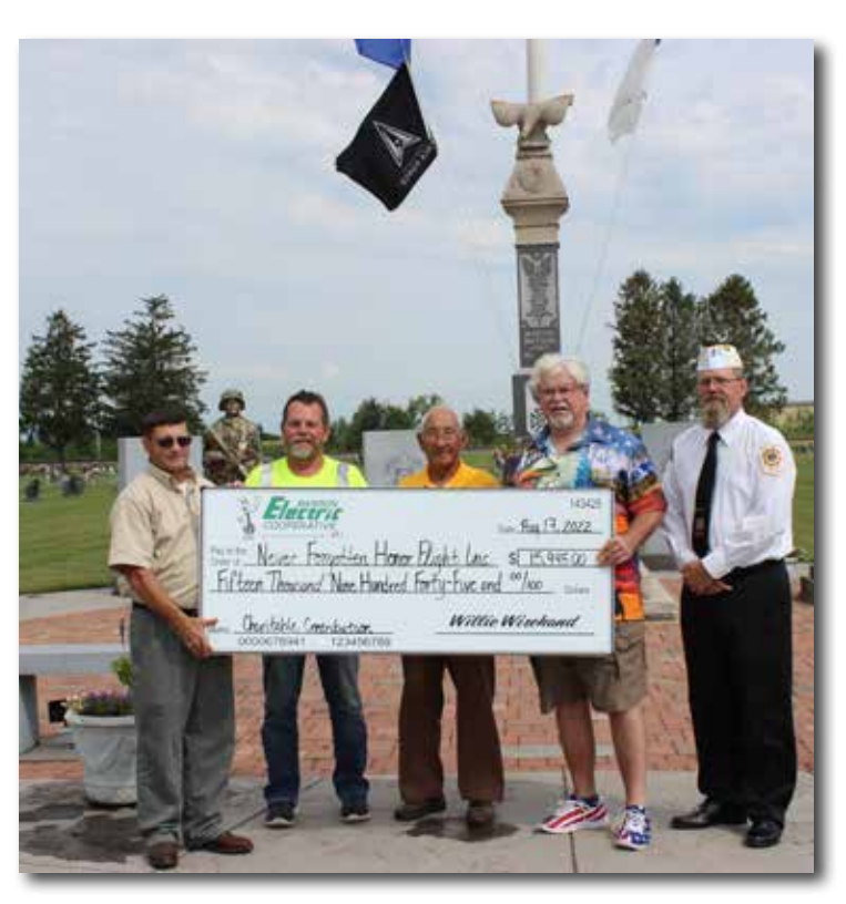
Barron Electric, Barron Maple Grove Fire Department, and CoBank teamed up to donate more than $15,000 to the Never Forgotten Honor Flight.