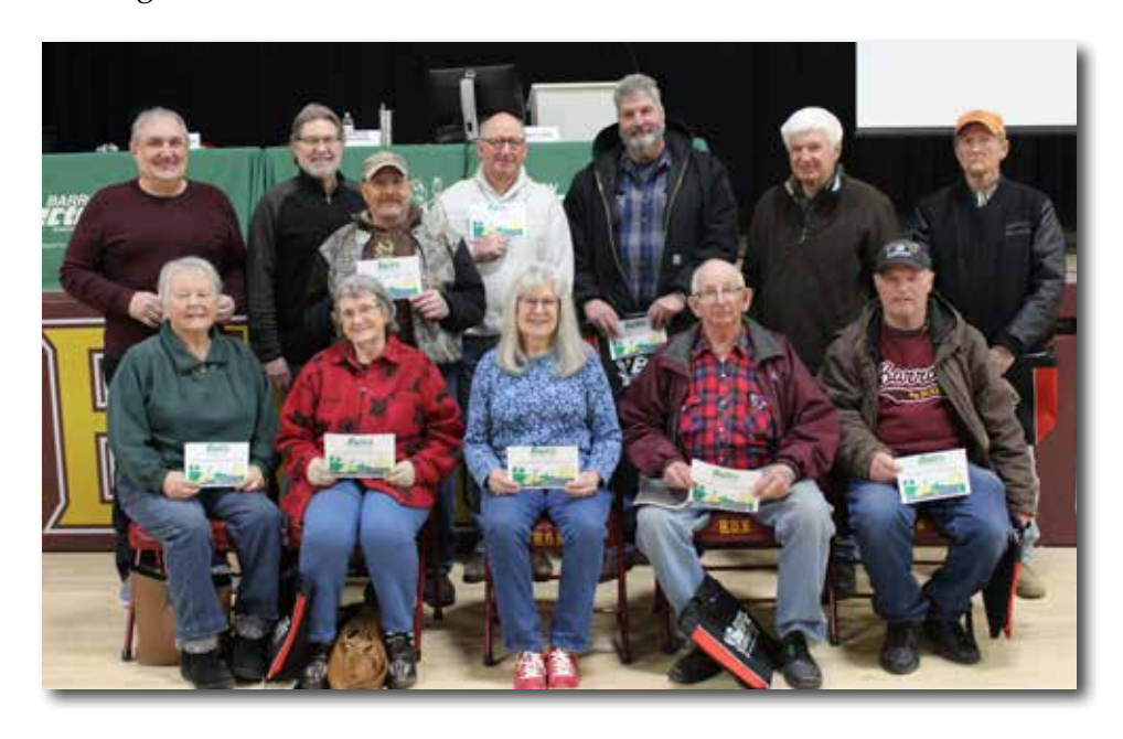
Pictured are the members who won $100 bill credits at the 86th Annual Meeting.

The board of directors' highest priority is to ensure the cooperative provides reliable, safe, and affordable power to members. Barron Electric has the second lowest rates in the state based on a monthly average of 1,200 kwh of usage. They are always working for the member's best interests.