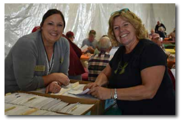
We were excited to distribute cashback credit checks in person in 2022.