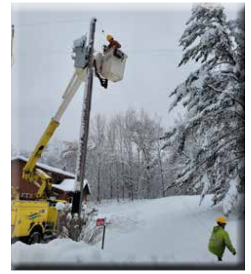
The December 15 storm left more than 9,000 members without power.

Participation Powers Progress is the theme of Barron Electric's 87th Annual Meeting. Your participation at today's meeting ensures that members elected to the