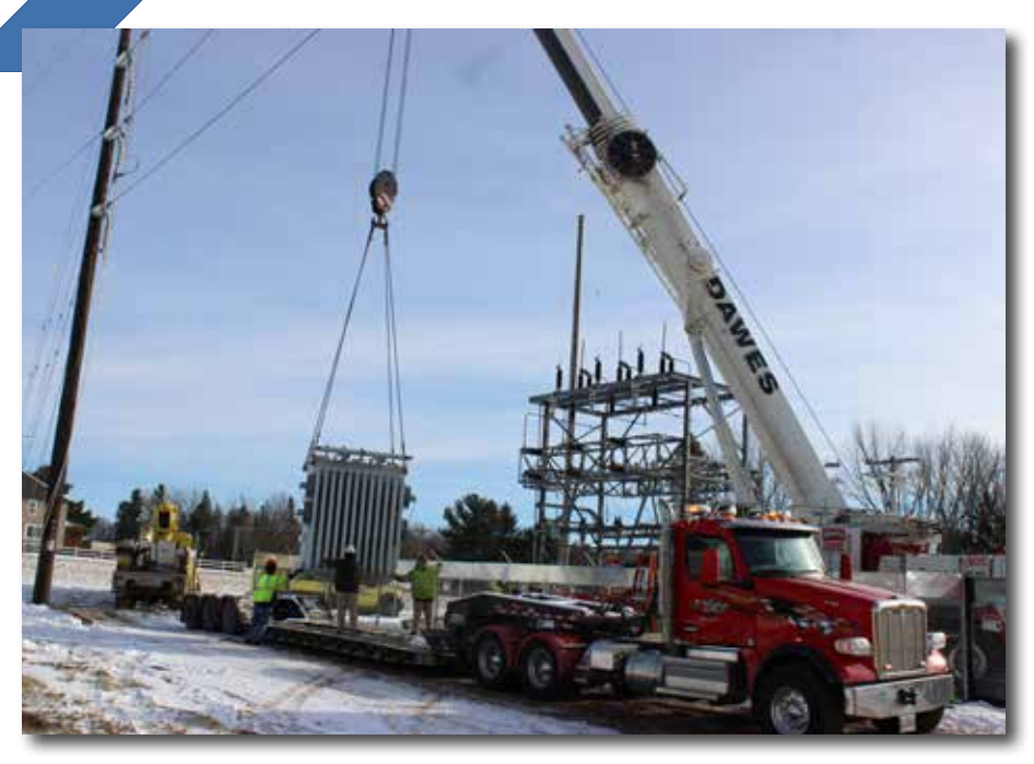
Crews upgraded the transformer at the Haugen Substation to help increase reliability.