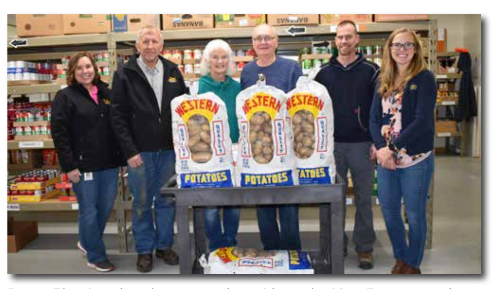
Barron Electric and employees teamed up with member Nuto Farms to purchase and deliver over 3,000 pounds of potatoes to 13 food pantries.