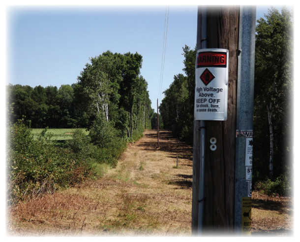
A clear right-of-way improves power quality, reliability and safety.

within right-of-ways, and make repairs when damage occurs. However, if fences in ROW are not routinely maintained by property owners, Barron Electric and contractors representing Barron Electric cannot accept the responsibility of fence repair due to age and normal deterioration.