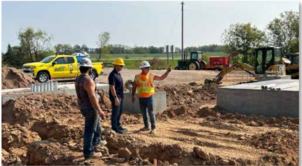
Construction has started on the North Wal Substation, located just north of the Walmart Supercenter.

Barron Electric is working with Substation Services, McDonald Construction, Bull Dozin, Inc., Antczak Construction, Inc., and Dairyland Power Cooperative to complete the project.