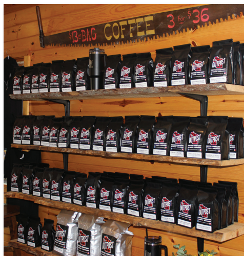
Find freshly roasted coffee in a variety of flavors.