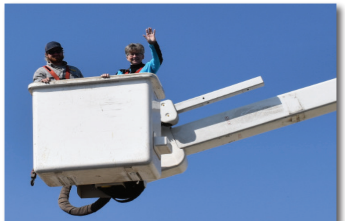
Blue skies and sunshine allowed for spectacular views and a glimpse of life on the line for attendees who were brave enough to take a bucket truck ride.