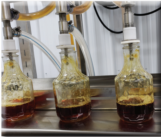
Amber and Mahlon Helms, owners of Helms Sugar Shack, offer handcrafted pure maple syrup, which is packaged and distributed to grocery chains and small businesses in several states.

Helms Sugar Shack will host an open house with a variety of vendors December 6 - 7 from 9:30 am - 4:30 pm. Check their Facebook page for more details. Helms Sugar Shack is located at 1638 14 1/2 Street, Barron. To order products, call 715-418-0929. For more information, visit helmssugarshack.com .