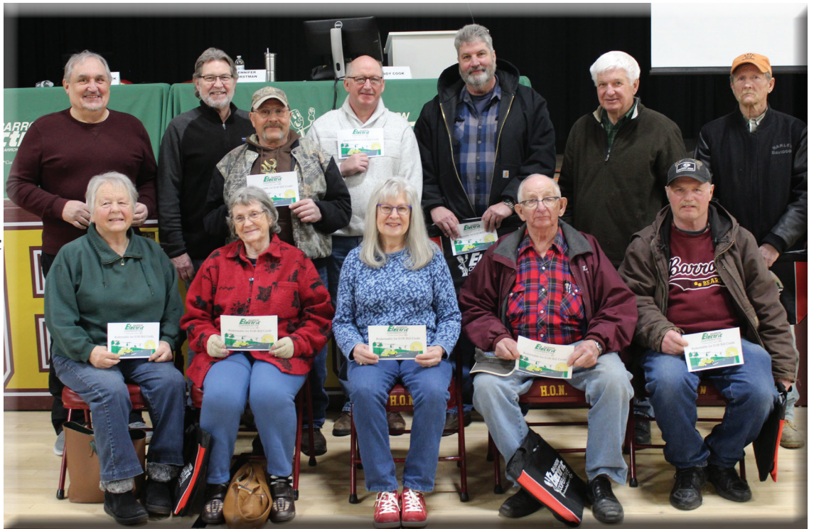
Twelve members were winners of a $100 electric bill credit.

Thank you to the businesses and organizations who donated items to the event. Maple Creek Sugarbush, Lost in the Woods Acres, Helms, A&M Pure, and Hustads donated maple syrup. Barron Kwik Trip donated bottled water, and the Barron County Dairy Promoters and the Cumberland Airport provided griddles.