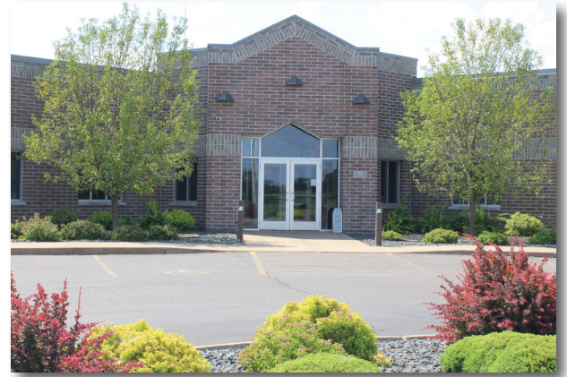
Barron Electric's 89th annual meeting will be held Tuesday, April 8 at Barron Electric.