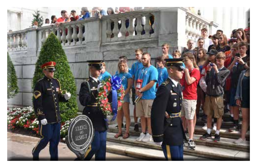
Students attending the D.C. Youth Tour visit Arlington National Cemetery.

More than 1,500 students from across the U.S. take part in the Youth Tour experience each year. Students, who are Barron Electric members, attending the WECA Youth Leadership Congress will have the opportunity to write an essay and win a trip to the 2020 D.C. Youth Tour. Students meet with their U.S. Representatives and Senators and explore the museums, memorials and monuments.