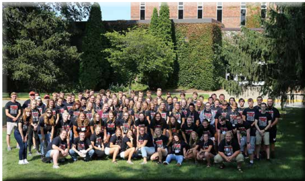
More than 120 students attended last year's Youth Leadership Congress.

D o you want to improve your leadership and communication skills, have the opportunity to organize a cooperative, and meet people from across the state? The WECA Youth Leadership Congress will be held July 24-26 at UW-River Falls. Social media coverage can be viewed by searching #wiscylc2016. For application forms, please contact our office at 800-322-1008 or memberservices@barronelectric.com .