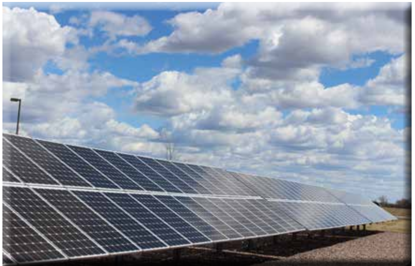
Community Rays has generated over 550,000 kWhs since it was installed.