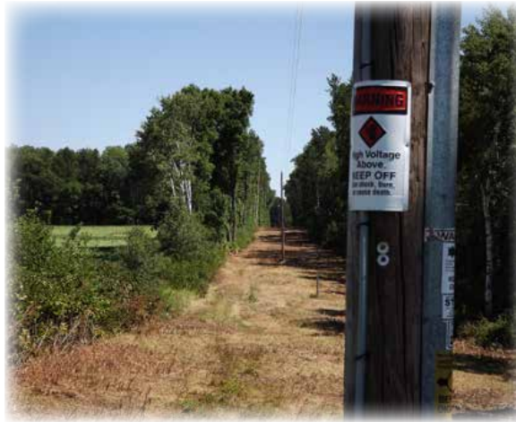
A clear right-of-way improves power quality, reliability and safety.