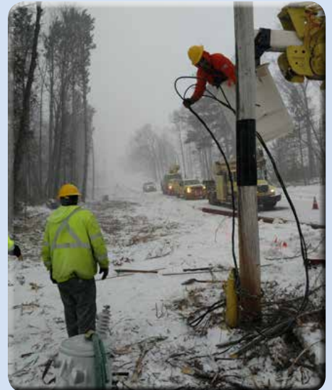
Linecrews were busy in March after storms caused downed trees and power lines.