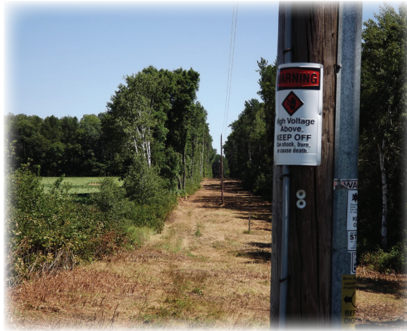
A clear right-of-way improves power quality, reliability and safety.