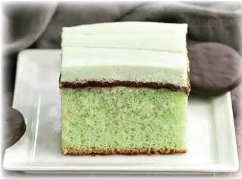
Creme de Menthe Cake

1 package white cake mix 3 T. creme de menthe liqueur 1 can chocolate syrup 1 container frozen whipped topping, thawed 2 T. creme de menthe liquer