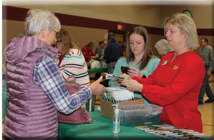
More than 300 members and guests attended Barron Electric’s 88th annual meeting.

of grocery items and cash to the Prairie Farm Food Pantry to help support those in need. The Barron VFW prepared and served breakfast to over 300 members and guests. Twelve Barron Electric members won a $100 cash prize. All attendees received a pound of cheese.