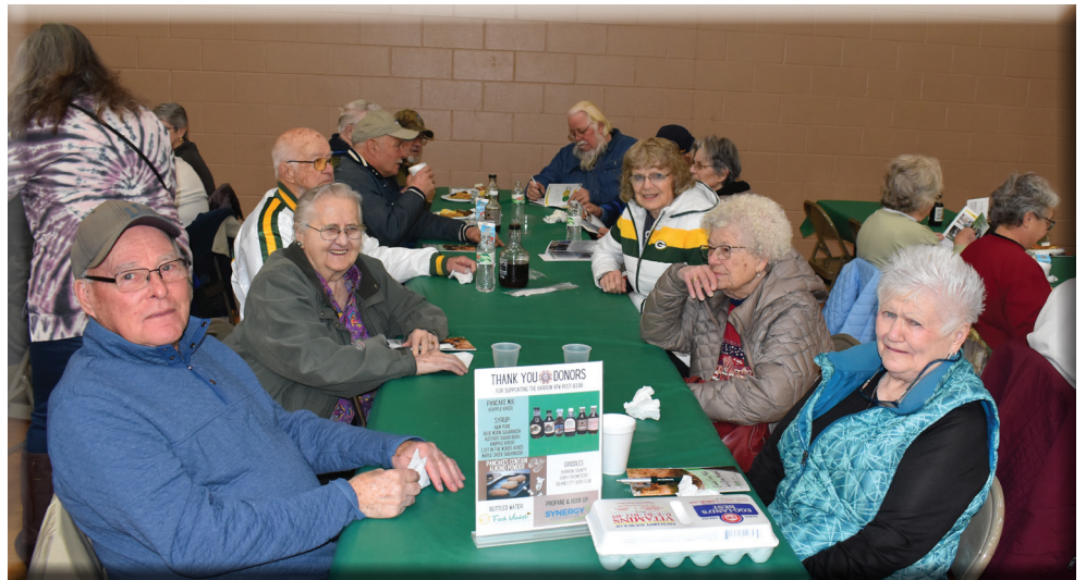
Members enjoyed a breakfast which was prepared and served by the Barron VFW.