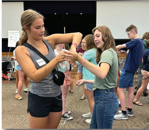
Students have fun with teambuilding activities.

Please contact Barron Electric at 800-322-1008 or e-mail memberservices@barronelectric.com for more details. The deadline for applying is June 7, 2024 .