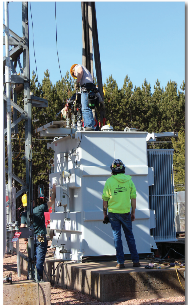
Crews prepared the transformer for energization.

B arron Electric Cooperative works hard to provide reliable power to our members. Barron Electric line crews recently worked with A1 Express, Qualus, Dairyland Power Cooperative, and Dawes Crane to change out the substation transformer at the Springbrook Substation to allow more capacity to supply electricity to the members in this area.