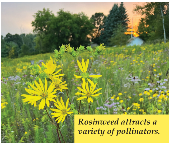
Rosinweed attracts a variety of pollinators.