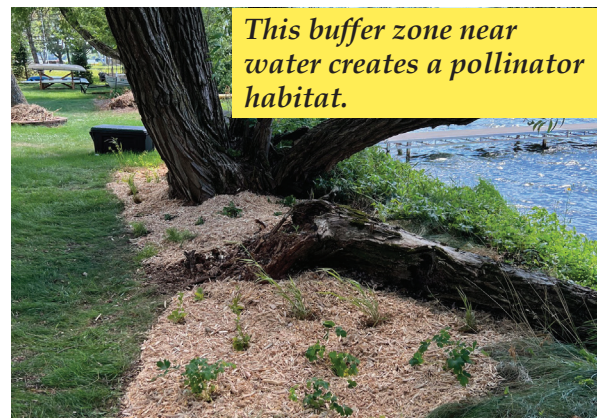
This buffer zone near water creates a pollinator habitat.