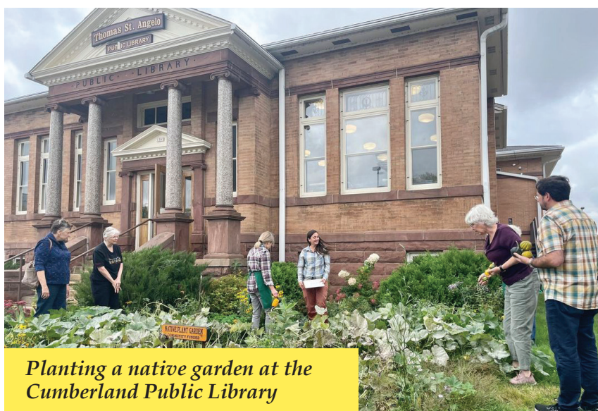
Planting a native garden at the Cumberland Public Library

For more information about Tamarack Wetland Services, LLC, visit them on Facebook, e-mail tamarackwetlandservices@gmail.com or call 262-352-3299.