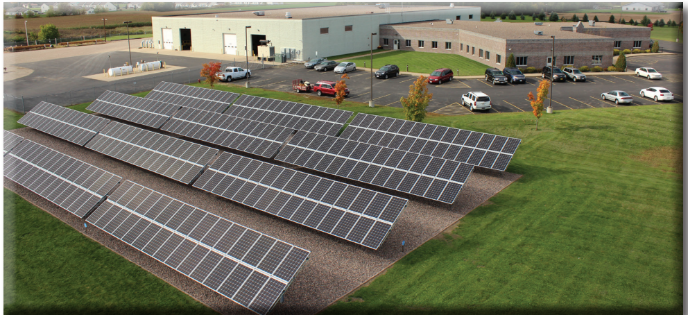
Community Rays was installed in 2014 at Barron Electric's headquarters and provides an affordable option for those members interested in purchasing renewable solar energy.

Barron Electric has installed electric vehicle charging stations in our service territory at the Prime Bar & Family Dining in Trego and at Barron Electric's offices in Spooner and Barron to give those