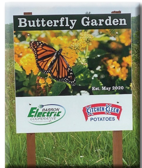
Butterfly gardens were created to attract the Monarch butterfly, which is on the endangered list.