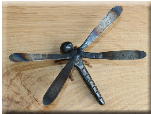
Joyce created this beautiful dragonfly displaying a variety of colors.