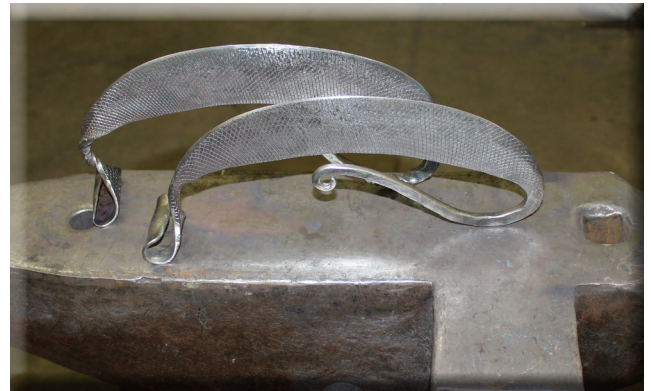
Unique pizza cutters complete a custom order.